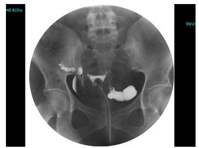
Figure 1: Spot image of Hysterosalpingography shows blocked left fallopian tube with hydrosalpinx

procedure and its complications. This procedure is ideally done during the proliferative phase of the menstrual cycle between 7-12 days of cycle. Before starting the procedure, proper positioning of the patient was done by laying in supine position on a fluoroscopy table, and a scout image of the lower abdomen and pelvis was taken to assess proper positioning, technique and pelvic abnormalities. By using aseptic measures, the patient was placed in a lithotomy position with cannulation of the cervical canal by catheter and 15-20 ml of water-soluble contrast medium, Urografin 76% (sodium Amidotrizoate + Meglumine Amidotrizoate) was injected slowly into the uterine cavity. Direct image visualization was done during the procedure to assess the anatomy of uterine cavity, patency of fallopian tubes, and any pathologies. Spot images / films of different phases of this procedure like early uterine filling, bilateral fallopian tubal filling, and peritoneal spill of contrast were taken. Afterwards, these HSG examinations were interpreted by the direct visualization of images during procedure and spot images, checking for unilateral and bilateral spillage of contrast medium into peritoneal cavity and abnormalities of uterine cavity and cervix.