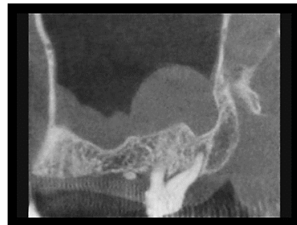
Figure 4: Coronal view

Out of the total 608 posterior maxillary sinuses examined, the antral artery was detected in 442 (72.9%) CBCT images (Figures 3 & 4).