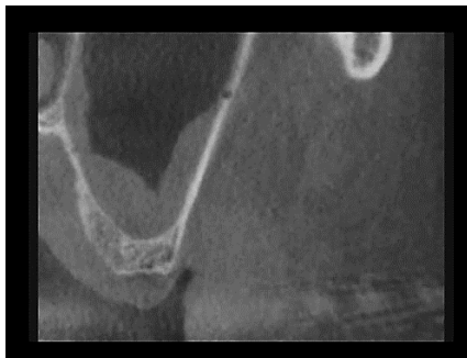
Figure 3: Sagittal view

The parameters noted included A) Presence of the AAA canal visible on the reconstructed CBCT images; B) The location of the antral artery with regards to the ridge crest. When the canal was apparent on the CBCT images, the distance from the lowermost point of the buccal alveolar ridge to the most inferior part of the radiolucent canal was evaluated vertically and noted.