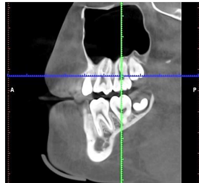
Figure 2: Sagittal view

background and a screen of computer (Intel® Core (TM) i3-3120M CPU @ 2.50GHz, Samsung Electronics Co. Ltd, Korea) were employed. As a pilot study, the CBCT images of randomly chosen 50 maxillary sinuses underwent evaluation twice with a gap of at least one month by each reviewer, supervised by an expert radiologist and an oral and maxillofacial surgeon. The intra-examiner variance was measured; Pearson correlation test of intra-examiner variance was calculated to be 0.987. The longitudinal and cross-sectional images assessed the occurrence and location of the antral alveolar artery. The artery was located according to the criteria mentioned by Apostolakis and Bissoon. 16 According to these authors, the occurrence of the artery canal should be investigated in the posterior region of last four maxillary teeth. In case of presence of antral artery, the distance was measured from artery's lower border to the buccal alveolar ridge crest at midpoint of both premolars, and the first two molars mesiodistally in coronal view (Figure 1). Sagittal view was used to confirm that measurements were taken at the midpoint of the tooth mesiodistally. (Figure 2).